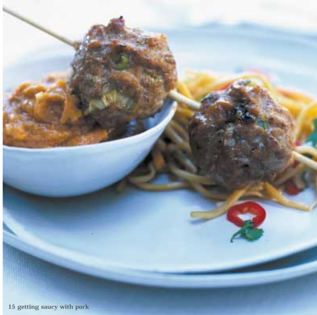
15 getting saucy with pork

Oven temperature: Gas Mark 6, 200°C, 400°F