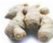
spicy pork & prune patties with oriental dipping sauce page 9