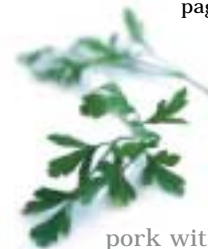
pork with black peppercorn sauce page 21