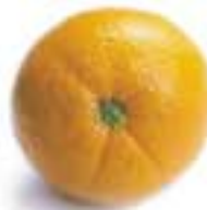
roast pork with white wine, oranges & oregano page 3

Visit our website to find more delicious recipes: www.meatmatters.com