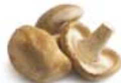
jerk pork spare ribs with barbecue sauce page 17