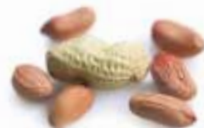
oriental pork meatballs with peanut sauce page 15