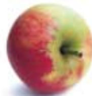
pork & mustard casserole with apple & sage dumplings page 7