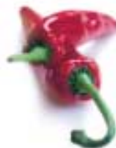
baked pork steaks with pepper & olive sauce page 13