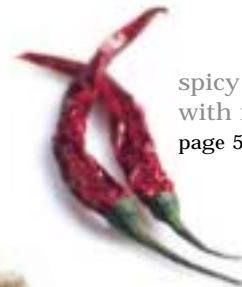
spicy pork skewers with mango relish page 5